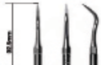
T9 Length: 32.5MM N.W: 1.0g

适用于去除龈缘下及牙周袋内的结石。 Removal of supra and subgingival calculus. It provides easy access to interdental spaces and narrow pocket.