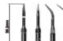
T6 Length: 30.2MM N.W: 0.9g

去除龈缘、齿间及龈缘下的结石，此工作尖较长，尤其适用臼齿。 Removal of supragingival and interdental calculus. This tip can be used in all quadrants and is very useful for the removal of hard calculus. Especially between molar teeth.