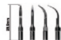
T1 Length: 29.9MM N.W: 0.9g

去除龈缘上及齿间的结石。 Removal of supragingival and interdental calculus.