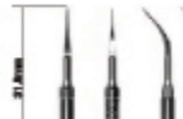
T8 Length: 31.8MM N.W: 0.9g

适用于去除龈缘下及牙周袋内的结石。 Removal of supra and subgingival calculus. It provides easy access to interdental spaces and narrow pocket.