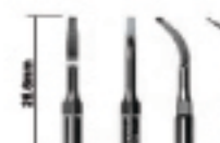
T2 Length: 28.6MM N.W: 0.9g

去除龈缘上的结石，尤其是难去除的牙结石及牙菌斑。 Removal of heavy calculus and stains in the supragingival area.