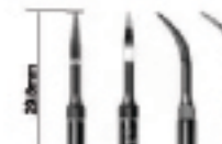
T4 Length: 29.6MM N.W: 0.9g

去除龈缘上及齿间的结石。 Removal of supragingival and interdental calculus.