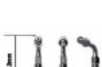
E1 Length: 21.2MM N.W: 1.0g

⚠ E1 is compatible with BAOLAI, same as T series tips.