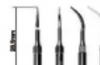
T3 Length: 28.6MM N.W: 0.9g

去除龈缘上及龈缘下的结石，尤其是去除狭小齿间的结石及牙周袋内的结石。 Removal of supra and subgingival calculus. It provides easy access to interdental spaces and narrow pocket.