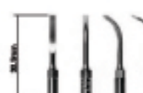
T7 Length: 30.5MM N.W: 0.9g

去除龈缘上的较难去除的结石，此工作尖较长，尤其适用臼齿。 Removal of supragingival calculus. This tip can be used in all quadrants and is very useful for the removal of hard calculus. Especially between molar teeth.